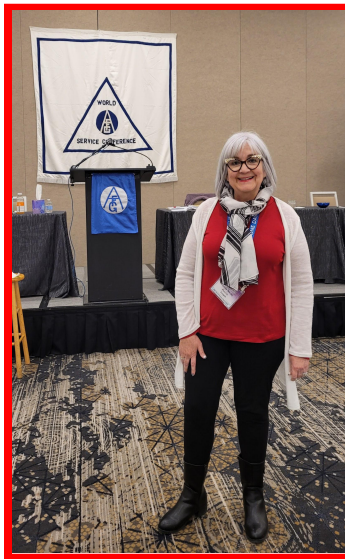
At the WSC meeting room Tarrytown, New York

Thanks for letting me serve as your Delegate... see you soon at our 2022 June Assembly!